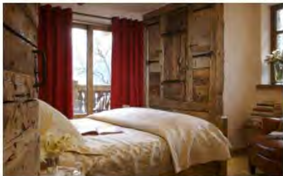
Accommodation at Chalet Merlo