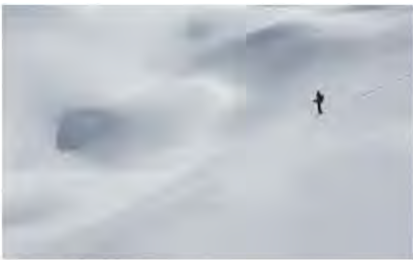
Solitude in Ste Foy

After skiing, hot tub, massage and dinner, it was hard to find energy to choose from the extensive library of films and games, or even to admire the chalet owners' eclectic art collection. A chauffeured drive to the bars of Val d'Isère, while offered, was never on my wish list.