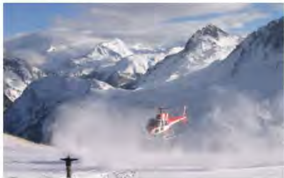
Heliskiing at Ste Foy

Première Neige's concierge service is also on hand to arrange extras such as instructors or mountain guides, ski equipment from SkiSet in Ste Foy, heliskiing, heli-transfers, yoga sessions, massages and spa treatments.