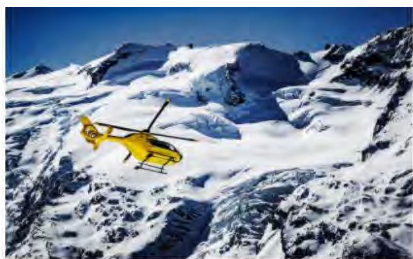
Chalet Merlo guests have the opportunity to enjoy heliskiing as part of their Ste Foy stay