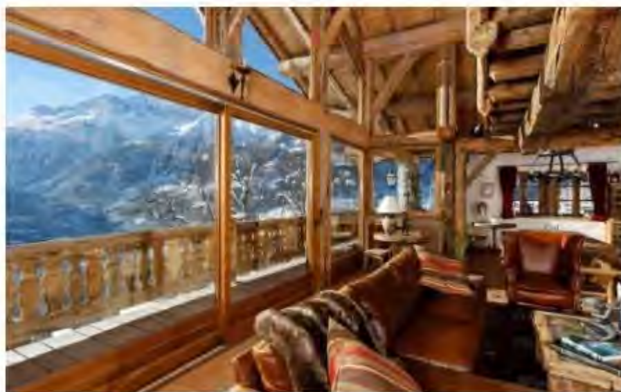
Spectacular mountain views from Chalet Merlo

The six-bedroom authentically Alpine Chalet Merlo is not one of those clustering at the bottom of the Ste Foy slopes, it is in the nearby village of Le Miroir, with an uninterrupted view over the Isère valley. There are no pistes here, but one of Ste Foy's most famous off-piste runs, the Fogliettaz, ends in the village. As does a well-known 2,000m heliskiing run down from Italy. Some of us might say that's a better draw than a blue piste to the door.